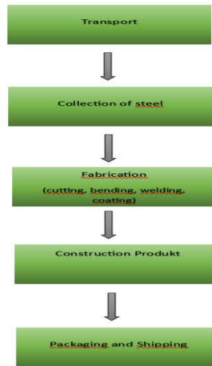
Figure 2 Manufacturing process scheme (A3)